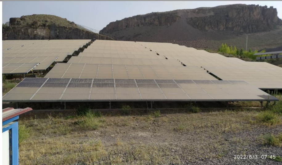
(Images taken after sandstorm in a test with 18 treated panels - Turkey, March 2022)

Nanotechnology-based treatment to increase the energy efficiency of solar panels